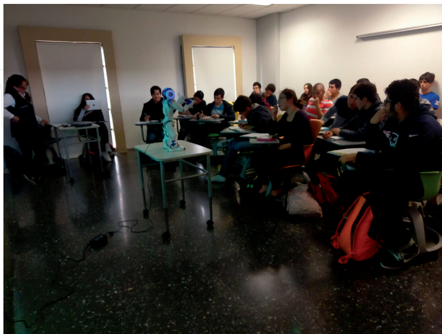
Figure 5. Use of a NAO robot in a high school class.

The study described in [20] analyzes how much attention a group of high school students give during a mathematics class when the teacher uses a NAO robot. The