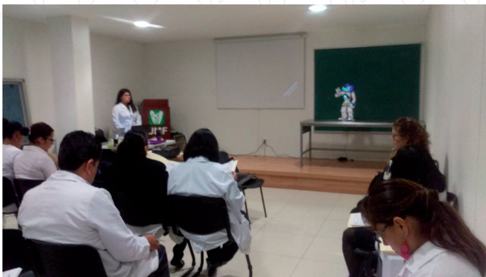
Figure 2. Use of a robotic platform for medical students training.

The results obtained from this study showed no significant difference between the evaluation and perception results obtained from the group that interacted with the robot and the regular group. As strange as it sounds, this is an excellent result since it can be concluded that a robotic platform is equally as good as a professional when explaining specific content to a group of people. It would still be necessary to control some environmental characteristics to make sure the results are as expected. However, it opens the doors for implementing these platforms in specialized training environments.