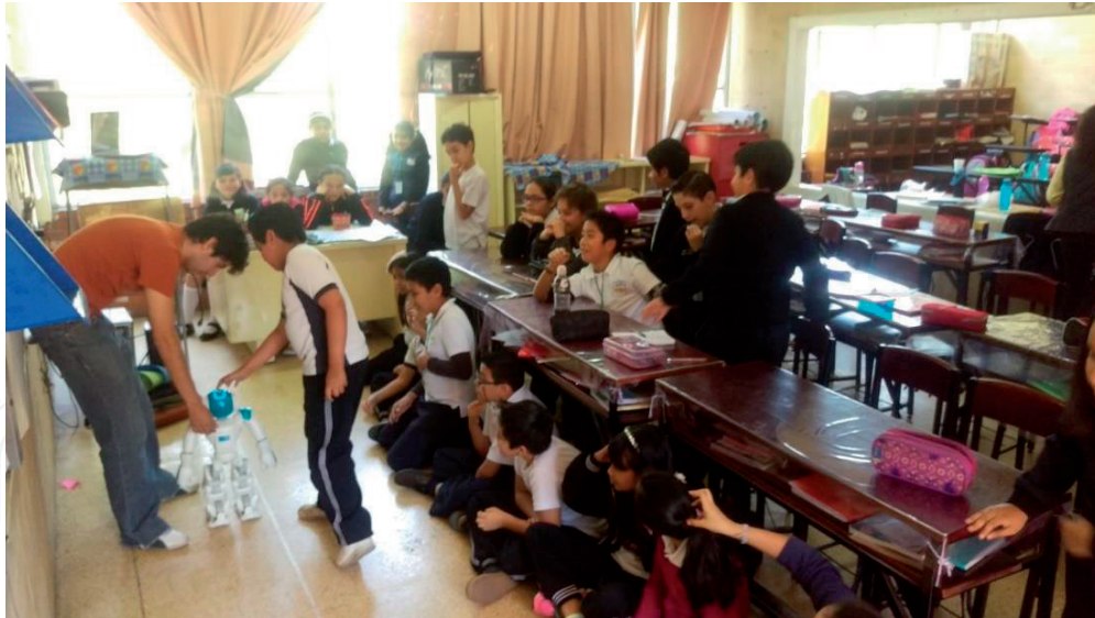
Figure 4. Metric system evaluation with a robotic platform.