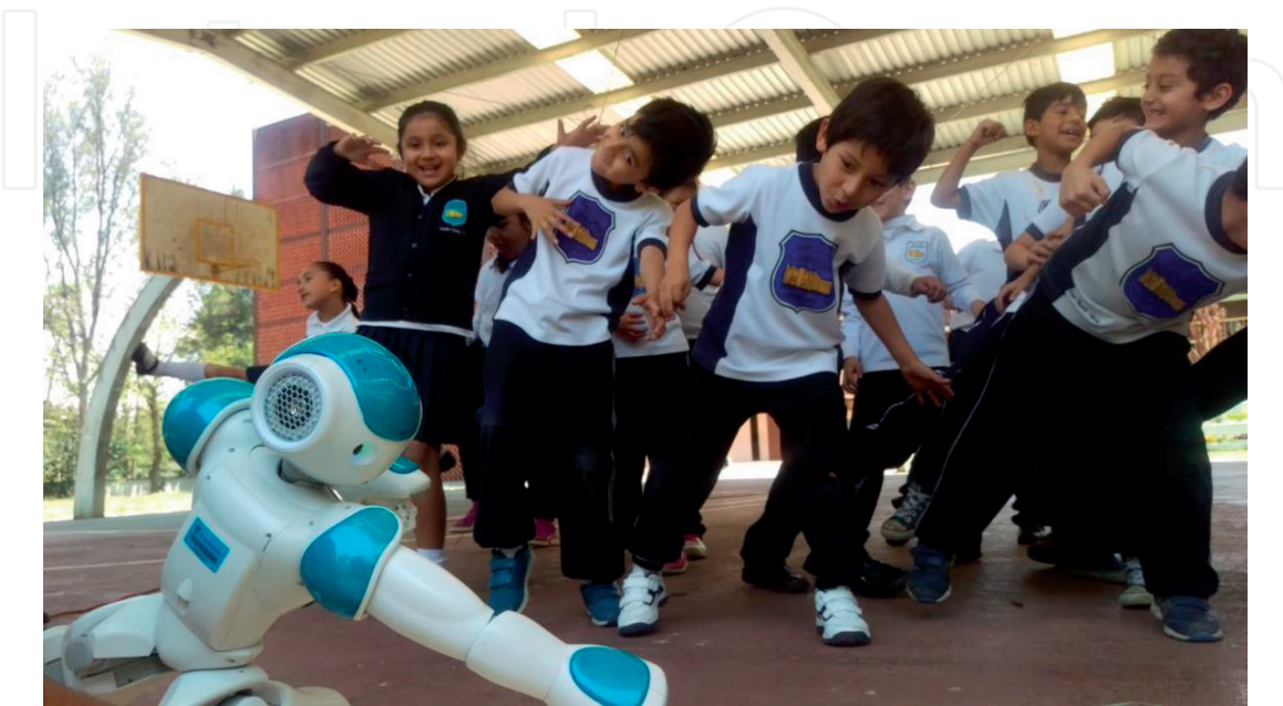
Figure 3. Physical education class with the support of a robotic platform.

A critical feature that elementary school needs to develop on their students is the ability to use mathematical and logical thinking in daily life situations. For this