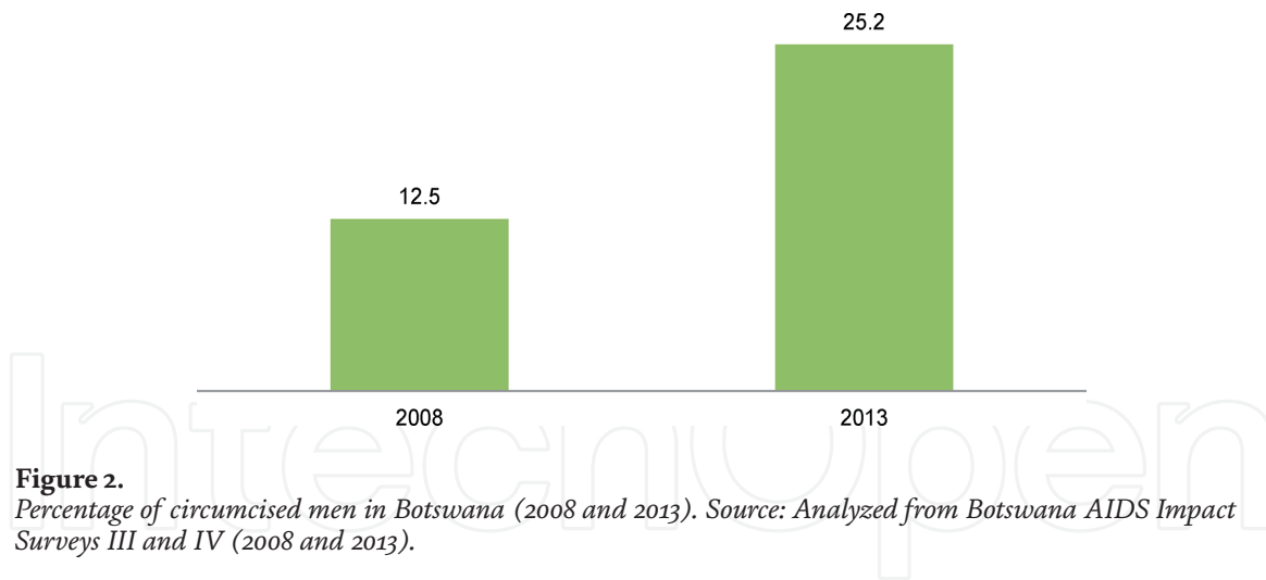
Figure 2. Percentage of circumcised men in Botswana (2008 and 2013).