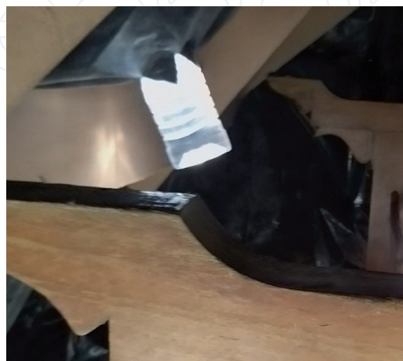
Figure 4. Test with one bottle of water.