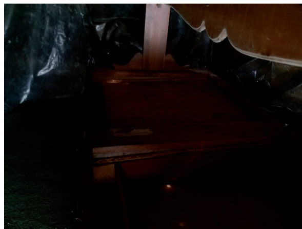
Figure 3. Scale model of the house, with roof, before the test.