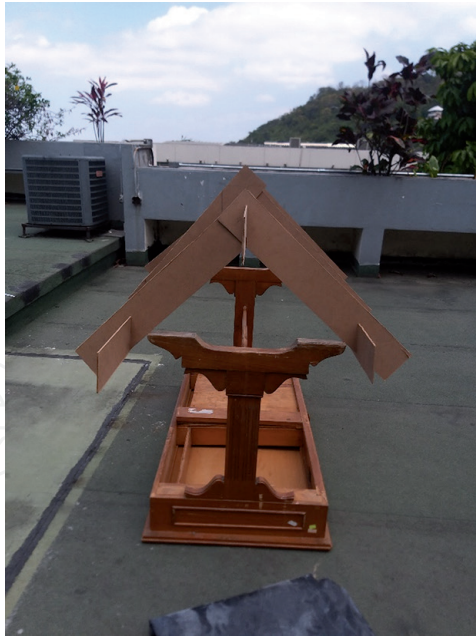
Figure 2. Scale model of the house, without roof, used in the test.