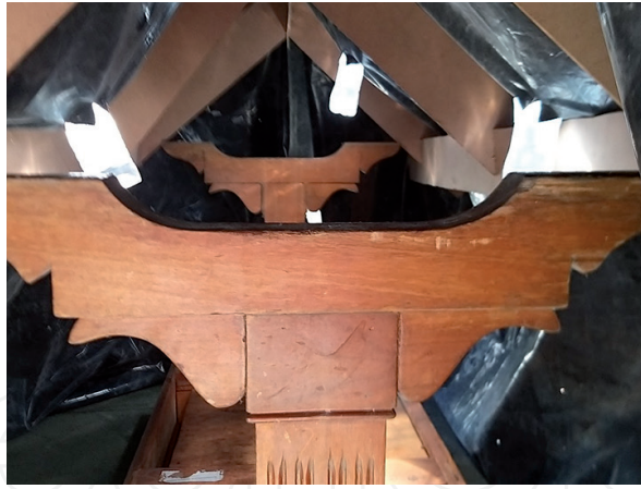
Figure 5. Test with three bottles with water and chlorine.