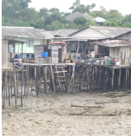
Figure 2. The Condition of Non Permanent Houses on Lengkang Island

affect the community's preference for household sanitation facilities, namely the type of house that has a toilet and how to dispose of waste (Lalasati and Hadi, 2019).