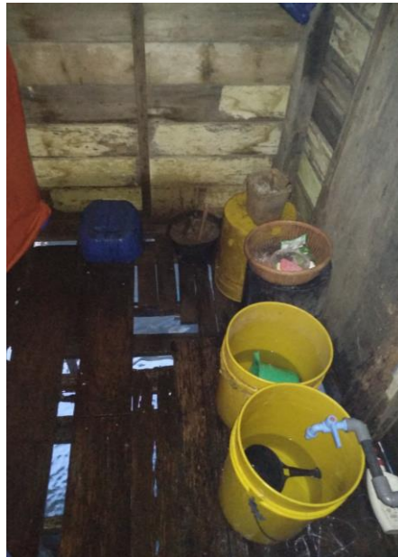
Figure 3. Examples of Simple Latrine Conditions on Lengkang Island

The results of observations on 107 house samples show black water and gray water are thrown away into the sea (simple pit sewage).