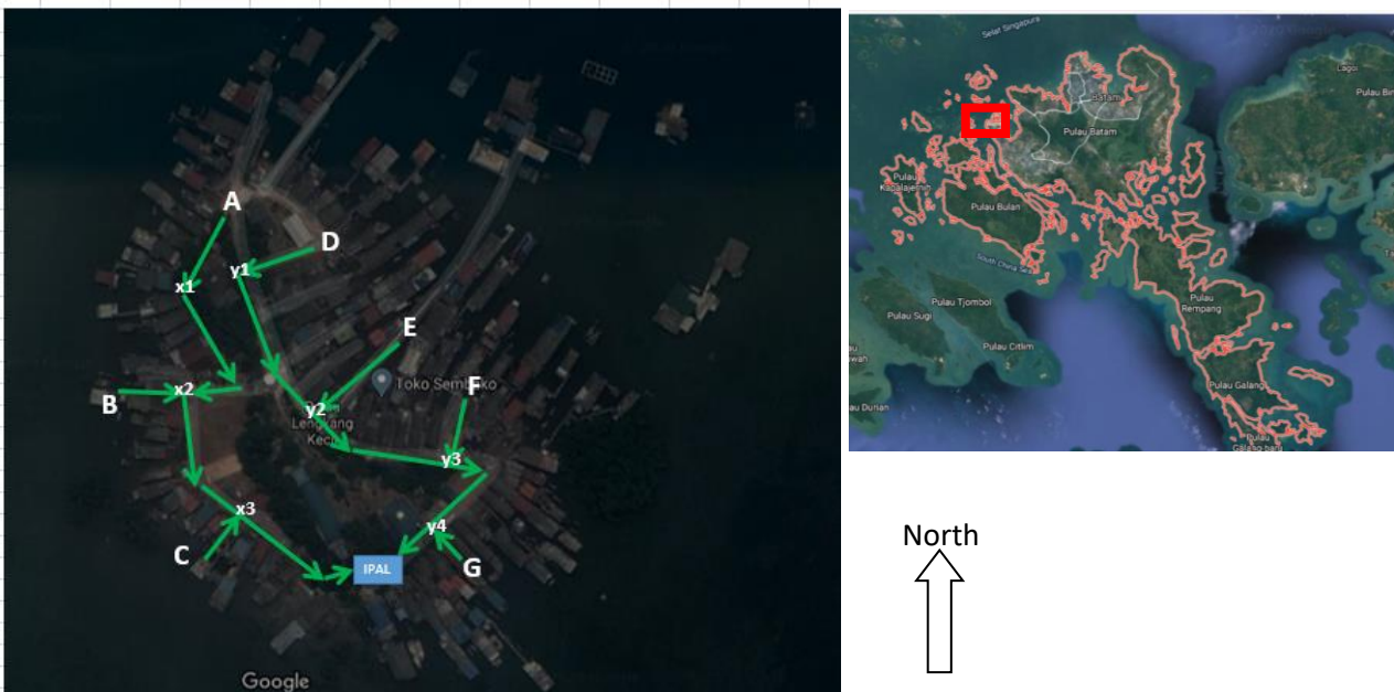
Figure 4. Map of Centralized Wastewater Sewerage System Planning in Lenggang Island.

The planned wastewater delivery system is a centralized system consisting of line x and line y. The residential area is divided into 7 residential areas. The housing area is housing A, B, C, D, E, F, and G. The design of the wastewater collection system can be seen in Figure 2. The calculation for parcel discharge is carried out by considering the service area for each line. In calculating the Q_r , the need for water used is 120 L/person.day. The need is used because the small island of Lenggang is still included in the administrative area of Batam City, based on SNI 19-6728.1-2002 states that the use of water in urban areas is 120 L/person/day. Q_{pp} is the total debit discharged by each house. Q_{pp} calculation results of each house can be seen in Table. 1.