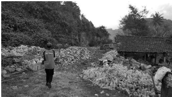
Figure 3. Separation of bottles and coconut shells.

Waste collection is also carried out by restaurant owners by cleaning their business premises routinely by using cleaning tools they have. The rubbish that is collected is then put into trash bins located around the beach. All beaches surveyed have a routine schedule of community service every Friday, including restaurants. One form of community participation in efforts to improve the environment is by providing labor contributions in the form of community service and participating in waste management and holding community meetings (Sulistiyorini, Darwis, & Gutama, 2015).