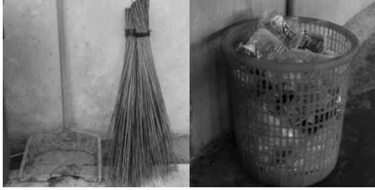
Figure 2. The cleaning tools in the restaurant.

Waste collection is also carried out by restaurant owners by cleaning their business premises routinely by using cleaning tools they have. The rubbish that is collected is then put into trash bins located around the beach. All beaches surveyed have a routine schedule of community service every Friday, including restaurants. One form of community participation in efforts to improve the environment is by providing labor contributions in the form of community service and participating in waste management and holding community meetings (Sulistiyorini, Darwis, & Gutama, 2015).