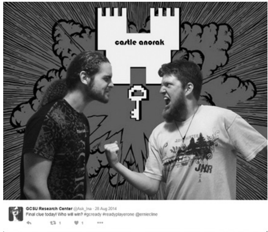
FIGURES 4 AND 5. SOCIAL MEDIA EXAMPLES