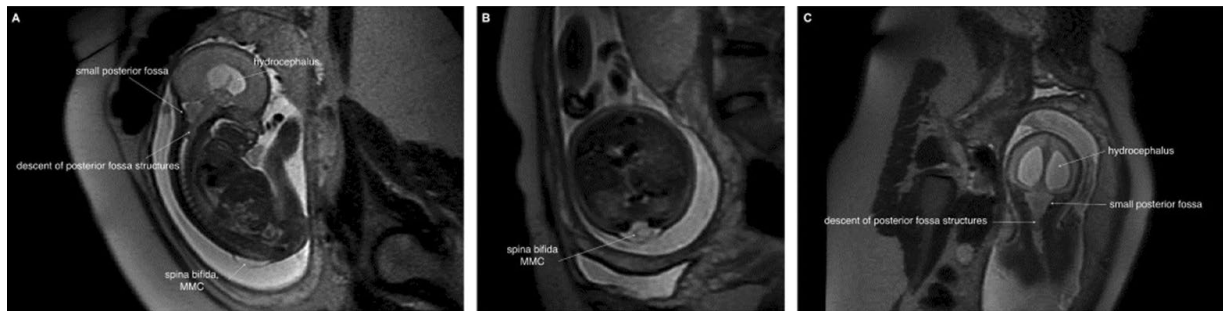
Figure 1. A. Fetal MRI, SSFSET2 sequence, sagittal plane: Chiari II — descent of the posterior fossa structures into cervical vertebral canal, small posterior fossa, supratentorial hydrocephalus, spina bifida cum myelomeningocele (arrows); B. Fetal MRI, SSFSET2 sequence, axial plane: Chiari II — spina bifida, myelomeningocele (arrows); C. Fetal MRI, SSFSET2 sequence, coronal plane: Chiari II — descent of the posterior fossa structures into cervical vertebral canal, small posterior fossa, supratentorial hydrocephalus (arrows)

VM was diagnosed when the atria of the lateral cerebral ventricles measure > 10 mm in diameter on an axial view of the fetal head, obtained at the level of the thalami [17]. The severity of VM was classified as: mild (lateral ventricular diameter between 10–12 mm), moderate (lateral ventricular diameter between 12.1–15 mm), and severe (fetal VM > 15 mm), sometimes also classified as fetal hydrocephaly (lateral ventricular diameter > 95 pc) [18].