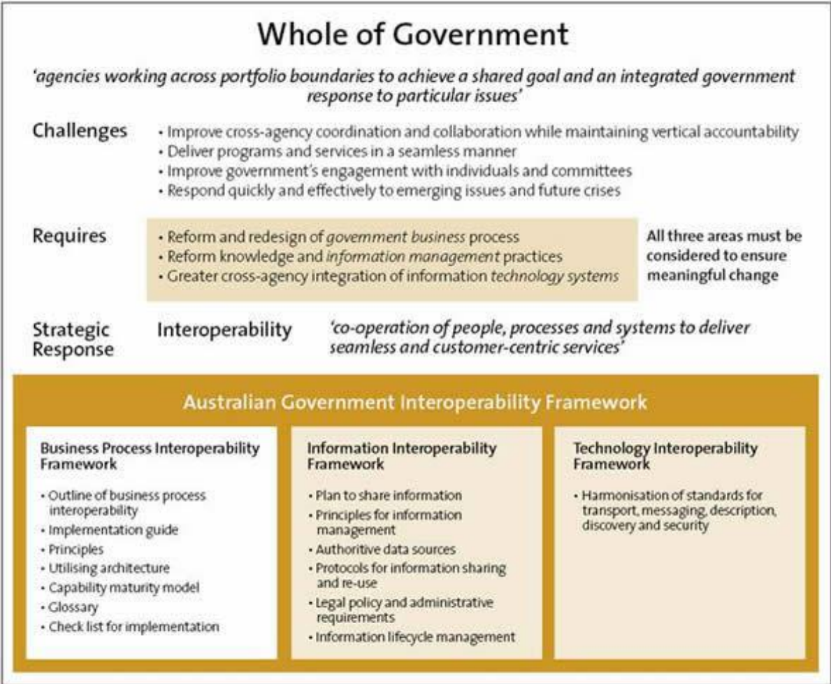
Figure 1. Interoperability in the Australian Government Source: AGIMO, Performance Indicator Resource Catalogue , (Australia: Department of Finance and Administration, 2007), p.20.

between organizations in their governance structures so that collaboration can be realized. This collaboration crosses the boundaries of each agency or institution by considering challenges and needs as well as how the strategic response must be carried out. The Australian Government in its interoperability work processes establish interrelated work processes, information and technology frameworks using an integrated government portal. Implicitly in the collaboration built with the