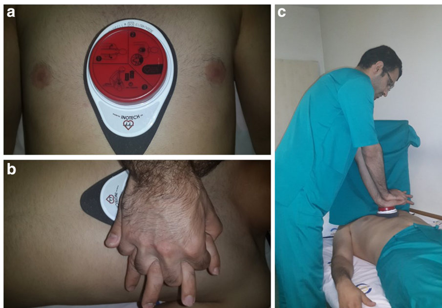
Fig. 2 Illustration of proper positioning of the Cardio First Angel™ device. a The device is positioned over the lower one-third of the sternum. The rescuer-side portion consists of a red, round push-button that displays a pictogram illustrating proper device use. b The push-button fits in the palm of the rescuer’s hand as it would lie on the sternum during manual cardiopulmonary resuscitation (CPR). c The rescuer should maintain straight arms and back and flex at the waist as in standard manual CPR

The Cardio First Angel™ is a lightweight device (130 g, 4.5 oz) that consists of three components (Fig. 2). The rescuer-side portion consists of a red, round push-button that fits in the palm of the rescuer’s hand as it would lie on the sternum during manual CPR. This rescuer-side component displays a pictogram illustrating proper device use. The center unit is composed of a stable plastic base that contains a complex arrangement of springs to transfer force to the patient’s thorax. The patient side of the device consists of liquid-absorbent polyurethane foam that disperses the compression force evenly across the device footprint. Application of 400 \pm 30 N of force (41 kg or 90 lb of pressure), which correlates to a sternum compression depth of 50–60 mm, is followed by an audible “click” sound to alert the rescuer to cease compression. The “click” sound is also audible upon spring decompression, alerting the rescuer to resume compression.