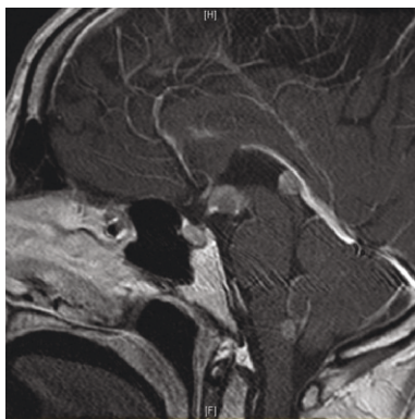
FIGURE 1: MRI brain, T1 sagittal + gadolinium, demonstrated lesions within hypothalamus, pineal gland, trigon of the right lateral ventricle, and foramen of Magendie at diagnosis.