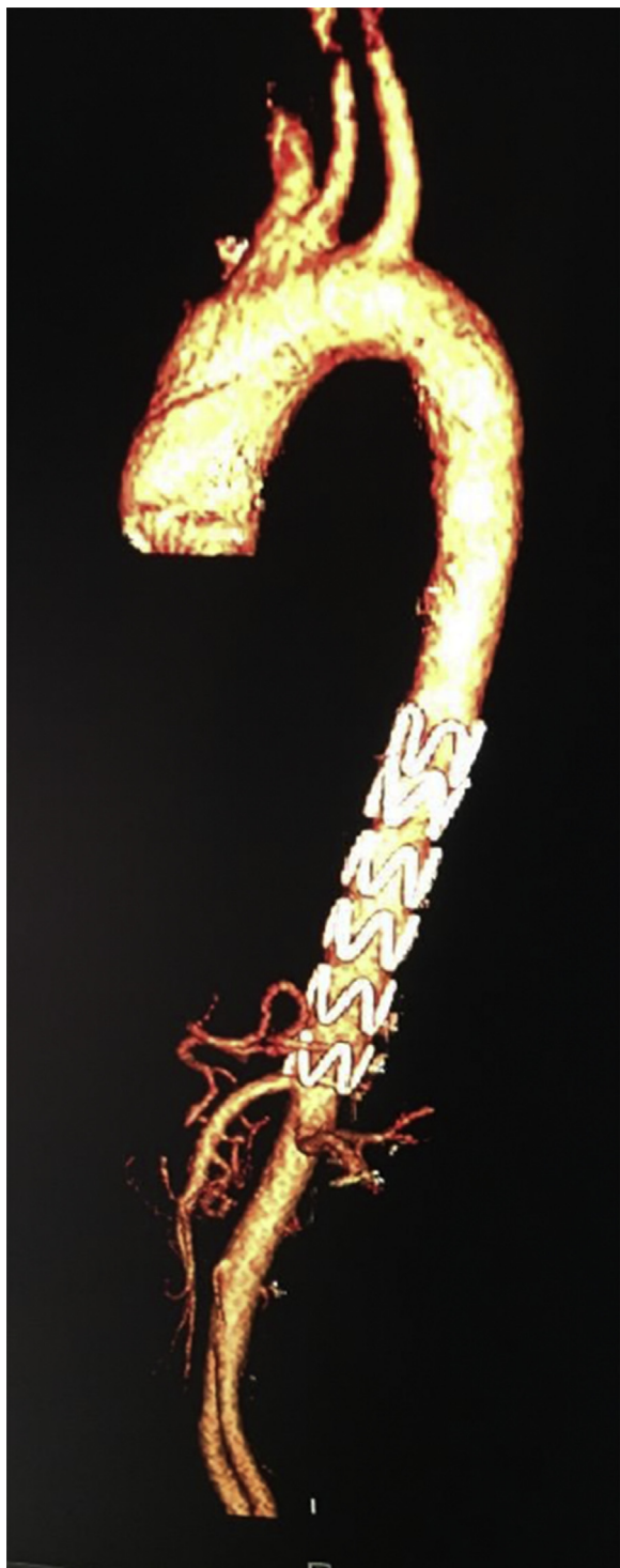
Fig 3. The 6-month follow-up computed tomography (CT) scan.

traumatic injuries. Confirming the presence of patent collateral vessels (most notably the gastroduodenal artery) to perfuse the celiac branches before celiac artery coverage is critical in this scenario. The literature from endovascular treatment of aortic dissections and