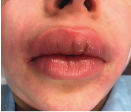
FIGURE 1: Prominent upper lip swelling with fissures that had persisted for four months.