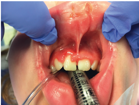
FIGURE 2: Maxillary gingival hypertrophy associated with lip swelling.

HCV antibody, HBV envelope antibody and antigen, C-reactive protein, immunoglobulin panel, C4 complement, C3 complement, glomerular basement membrane antibodies, and cytoplasmic neutrophil antibodies) were performed and were reported to be within normal limits. No clinical signs or symptoms of gastrointestinal disease were present.