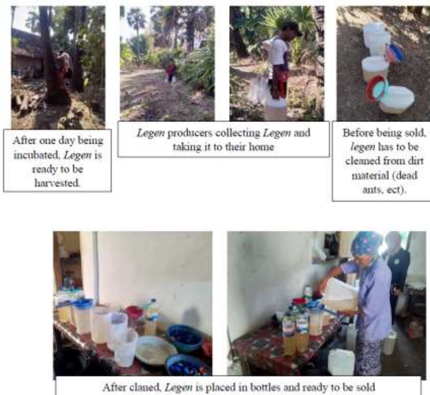
Figure 3. The Process of making Legen in Boto Village