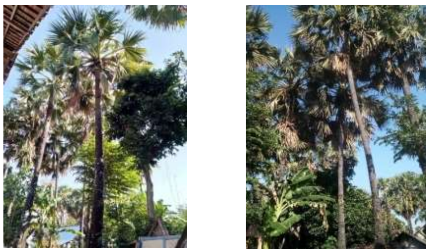
Figure 1. Palmyra Palm ( Borassus flabellifer ) Trees in Boto Village, Merakurak Sub-district, Tuban Regency.

Because of the great amount of limestone area (table 1), freshwater in Tuban Regency is polluted by limewater. That can potentially cause someone who drinks limewater in Tuban Regency suffer urolithiasis and kidney stone disease (renal calculi). According to Radar Bojonegoro's reports (local newspaper in Bojonegoro City, a city nearby Tuban Regency), the leader of Public Health department, Achmad Hernowo, said that water which contained lime in Bojonegoro is exactly able to become one of many factors that leads to kidney stone disease (Radar Bojonegoro, March 28 th 2019). On the other side, as one of the regencies which is located in Pantura area (north coast of Java Sea), Tuban has an abundant natural product. As Tuban is directly facing Java sea, this town's temperature is hot enough. This climate create typical natural product which is different from other regions. For example, Legen . Legen is a traditional drink from Tuban which is usually consumed as soft drink and even medicine. Legen is made from Palmyra palm's sap. Palmyra palm or Borassus flabellifer (figure 1) is the member of Aracaceae family. All parts of this plant can be utilized, starting from its root, stem, flower, fruit, leaf, until seed coat. This plant usually lives in dry area, like in Tuban. Extent of cultivation and productivity of Palmyra palm ( Borassus flabellifer ) is shown in table 2.