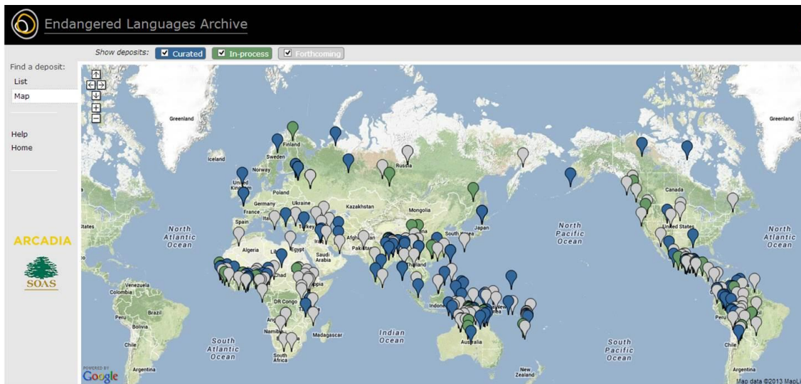
Figure 1: Map of ELAR-deposits as at August 2013

This level of funding had an influence on the topics that linguists (and others) chose to research, and the research methods they employed. The broader impact on the field of linguistics can be seen in the emergence of academic journals specialising in language documentation issues (Language Documentation and Conservation, Language Documentation and Description), specialist conferences, workshops and training courses (including InField and 3L summer schools, and the specialist MA and PhD programmes at SOAS (Austin 2008)), and a growing list of book publications on topics related to language documentation (for an annotated bibliography see Austin 2013).