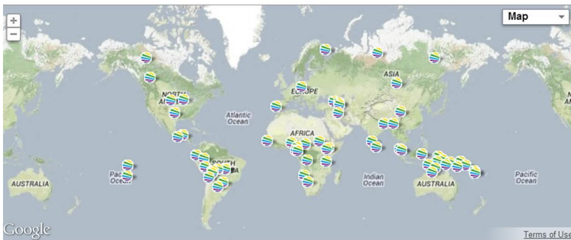
Figure 2: Map of Volkswagen-funded DoBeS projects