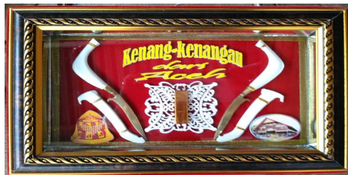
Figure 4. Rencong blades placed within a frame traded as a souvenir

The blades obtained from simple casting method were produce in relatively short time (Figure 3a). To produce a blade of rencong, the craftsmen only required approximately for three minutes, which was much shorter-time compared to the time needed to produce a single blade by traditional casting metal techniques with one hour. The Figure 3b shows the finishing process manually by hands, and the Figure 3c displays the results of the finishing process. The marketing steps are not only sold in form of a souvenir, but also in a single blade. The following Figure 4 shows a souvenir form of rencong a blade, which is traded in local market.