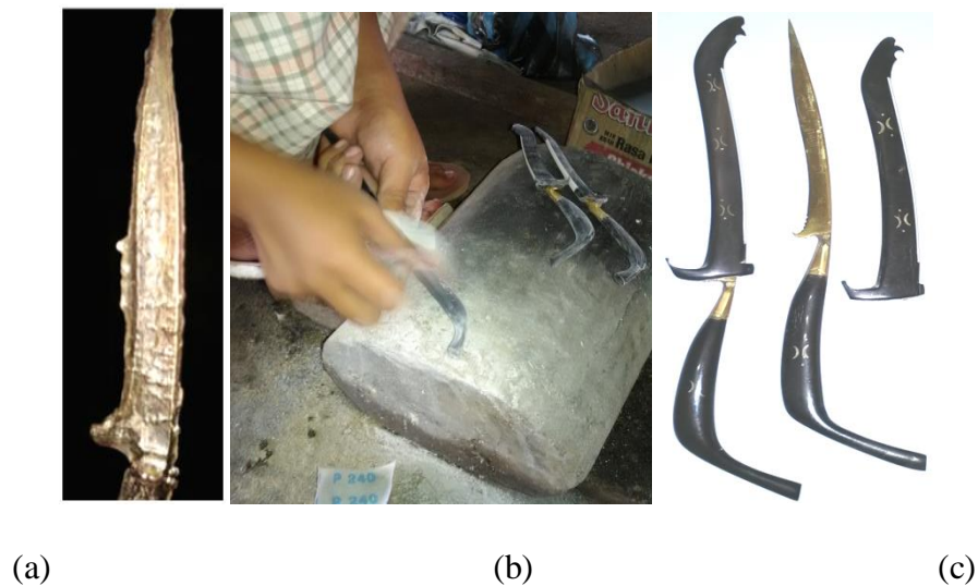
Figure 3. The blades of rencong produced from metal brass waste

were skillfully and quickly to understand in operating the casting tools. These are caused by the simplicity of the casting technology, and the experiences in casting the rencong by metal casting technology.