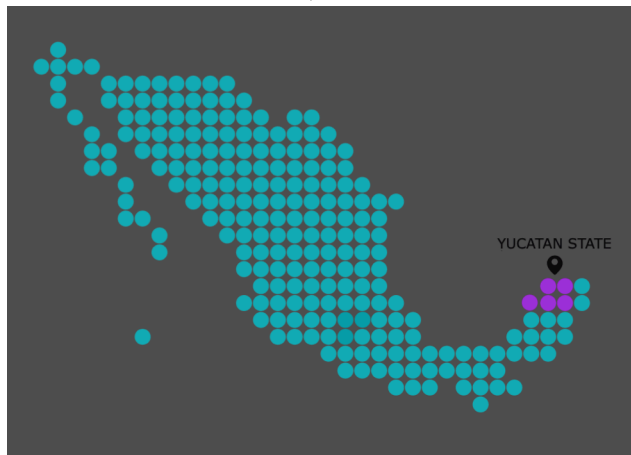
FIGURE 1 Yucatan State, Mexico