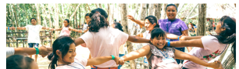
Abriendo Futuros weekly workshop. Yucatan, 2017