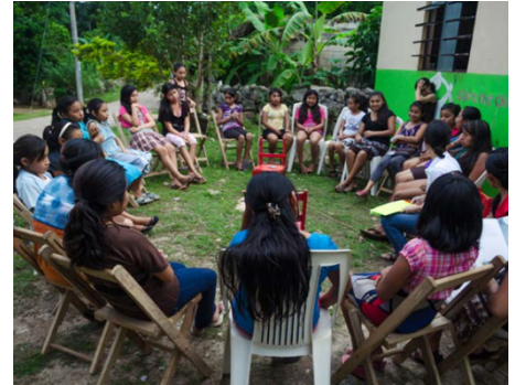
Abriendo Futuros weekly workshop. Yucatan, 2017

As for education quality indicators, indigenous preschools and elementary schools (versus nonindigenous schools) have younger and less prepared teachers, poorer infrastructure (e.g., construction material, desks, access to computers and internet), and poorer educational attainment results in Spanish, math, and natural science. This is reflected in a higher dropout rate in middle schools and high schools in indigenous municipalities versus nonindigenous municipalities, as well as a lower return in education for indigenous