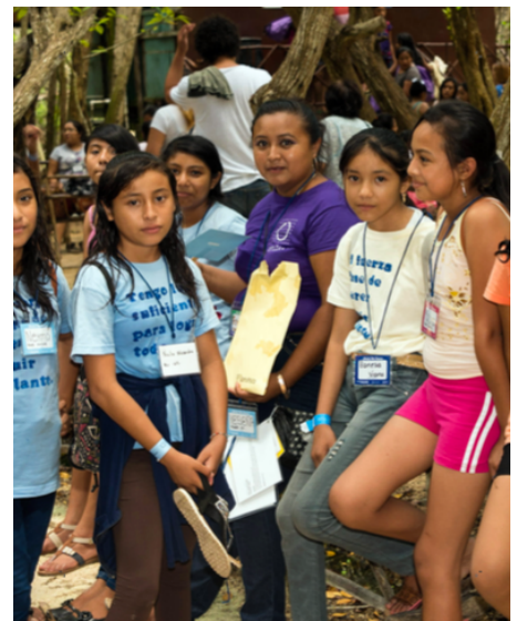
Mentor (center) with Abriendo Futuros participants on excursion to the ecological reserve "El Corchito." Yucatan, 2017