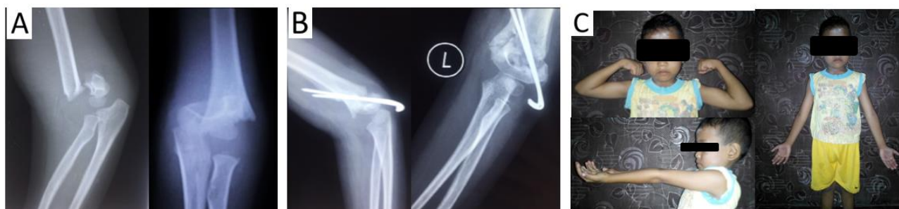
Figure 2. Clinical and Radiology Results of Lateral Fixation of Gartland type III SCHF (A. Pre-fixation plain image, B. Post-fixation plain image, C. Post-Surgical Clinical Image)