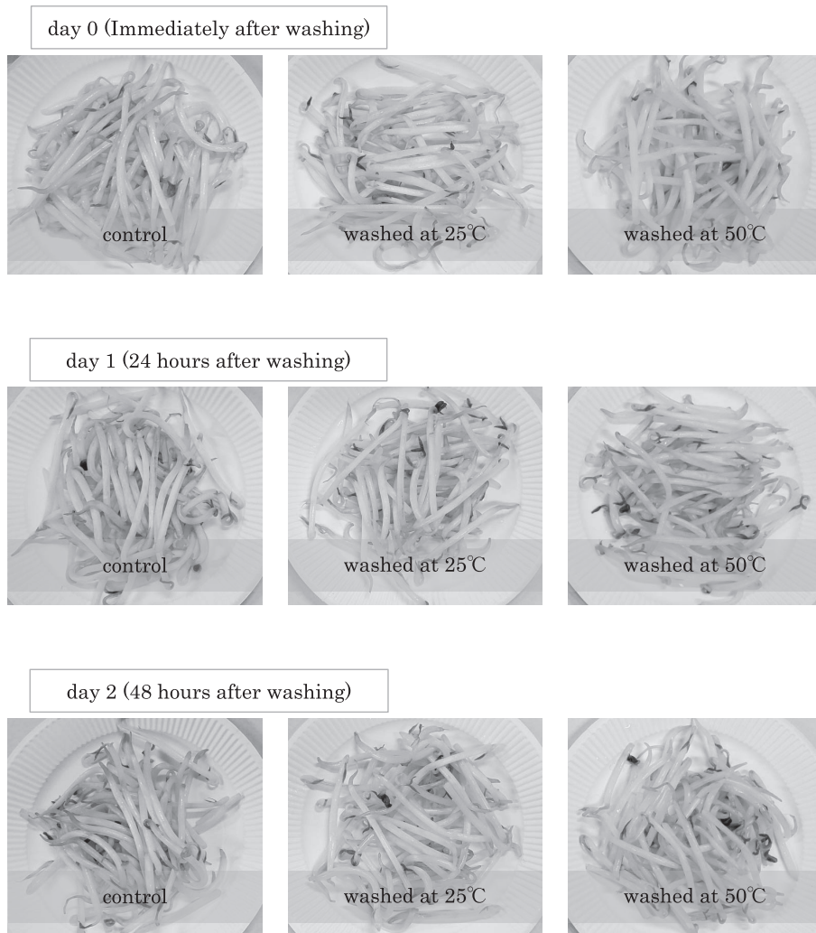
Fig.3 Appearance of bean sprouts immediately after washing and after storage for 24 or 48 hours after washing Bean sprouts were washed in tap water of 25°C or 50°C for 3 minutes before storage. Control bean sprouts were not washed after opening the package.

The sprouts with better food texture, less bitterness, and preferred were selected on sensory evaluation. The results are shown in Table 3. Although there was no difference in the texture and preference, the number of panels that were evaluated as having less unique bitterness of bean sprouts washed at 50°C was significantly higher.