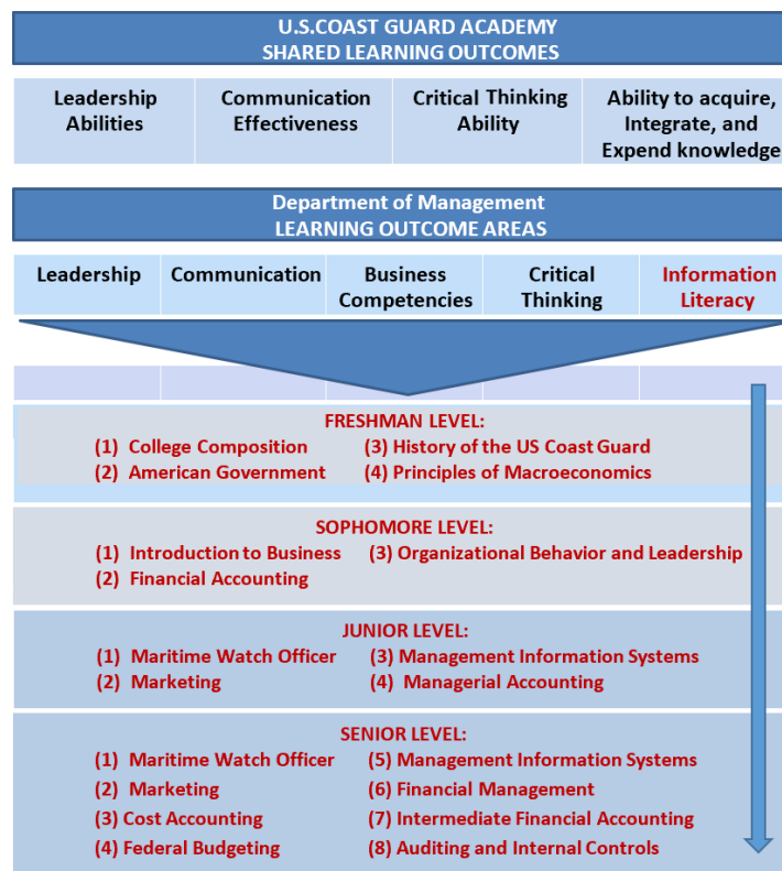
Figure 1. Management Department at U.S. Coast Guard Academy Shared Learning Outcome and Information Literacy

Source: Management Department, the U.S. Coast Guard Academy.