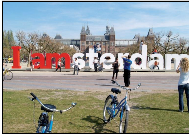
Fig. 2 Students received basic information about scenery, photography, art and typography. The sculpture located on the Museumplein in Amsterdam.

with appropriate activities that are different from academic routines. It is important to educate students that landscapes need to be beautiful as well as useful (Shelly, 2014).