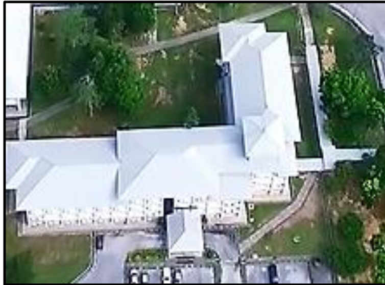
Fig. 1 FSSR 2 is surrounded with open spaces

Faculty of Art & Design (FSSR 2) is surrounded by green spaces (Fig. 1). These green spaces can be utilized for student use on campus. Moreover, the lack of outdoor facilities for students to relax, meet friends, socialize and engage in informal activities has long been an issue in this faculty. Ignoring this issue will lead to students' discomfort to do activities outside of which may contribute to the waste of electrical energy as they forced to use academic spaces for informal purposes. Therefore, this study explored the campus environment and proposed the featured idea to look at how students' perceptions and responses towards integrating the typographic landscape on the campus.