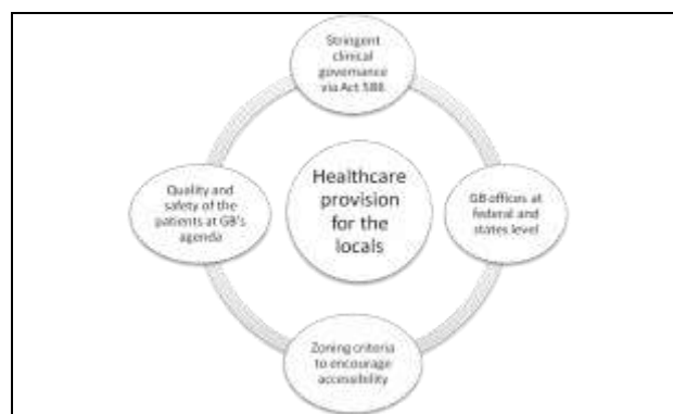
Fig. 2: Private healthcare sector with its distinctive Branch under the MOH signifying the provisions of healthcare for the locals

'... everyone gets access to healthcare. Otherwise, everyone needs to go to Kuala Lumpur to get access to good hospitals, and this shouldn't be happening'.