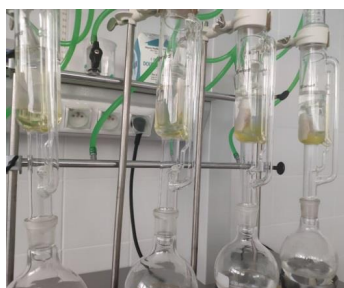
Fig. 1. Soxhlet device

Mass fraction of moisture is carried out in a drying cabinet by drying to constant weight at a temperature of 102 °C ( Fig. 2 ).