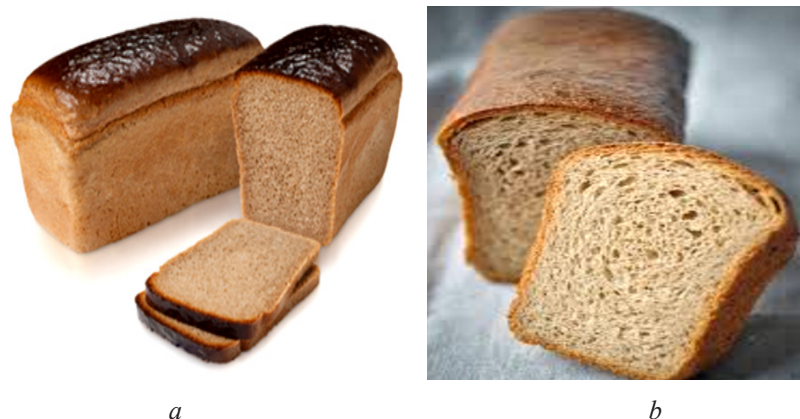
Fig. 1. Experimental bread samples and a device for determining the specific volume: a – bread “Kharkiv Rodnichok”; b – Darnitsky bread

In Fig. 1, 2 shows experimental samples of wheat-rye bread “Kharkiv Rodnichok” and devices used for researches of qualitative indicators of bread.