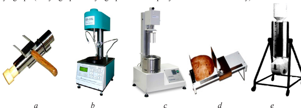
Fig. 2. Devices used for research of qualitative indicators of bread: a – device Zhuravlev; b – penetrometer AP-4/2; c – amylograph-E; d – VFH-250; e – volume RZ-BIO

The specific volume of bread was measured using a RH-BIO volume (Russia); the determination of the porosity of the crumb was carried out on the device Zhuravlev; swelling – on an amylograph (Amylograph “Amylographer-E” company “Brabender” Germany).