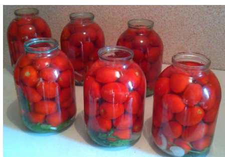
Fig.1. Experimental variants of tomatoes with the different nitrate content at pickling

The second part of the studies investigated the influence of the technology of pickling tomatoes with the different nitrate content on the dynamics of the change of microflora quantity and denitrification process. Tomatoes with the nitrate content within MPC– 137\pm 10 mg/kg; two times more MPC – 619\pm 32 mg/kg and 5 times more than MPC – 1576\pm 114 mg/kg were used in the study. The experimental variants of tomatoes are presented on Fig. 1 .