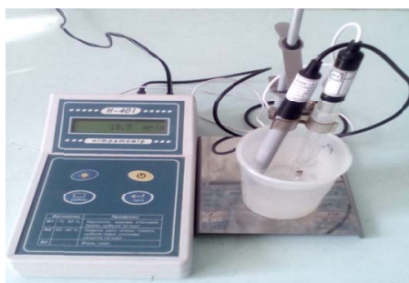
Fig. 2. Nitratometer device (H-401)

Nitrate content in vegetable products was determined by the ionometric method using the nitratometer H-401 (Ukraine) ( Fig. 2 ).