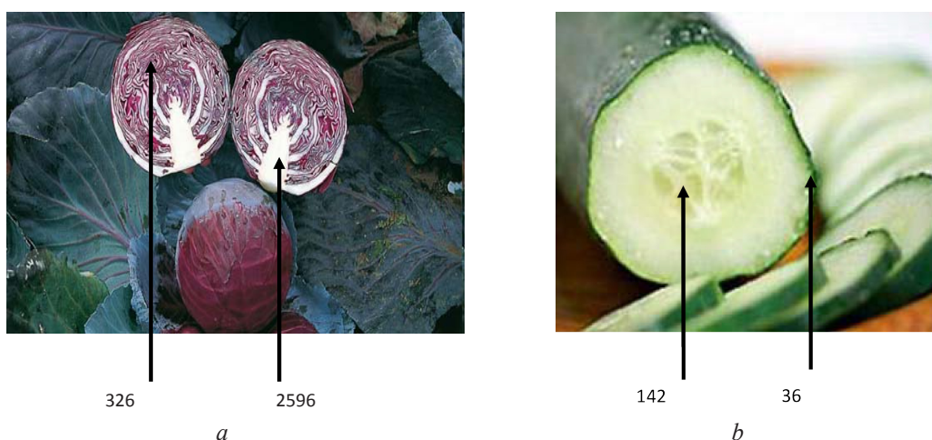
Fig. 5. Distribution of nitrates in vegetables: a – in cabbage; b – in cucumbers, mg/kg

At studying the nitrate distribution in vegetables, it was established ( Fig. 5 ), that in cucumbers, carrot, potato and table beet, the least quantity of nitrates accumulate in the external part of vegetables (near the surface), and the most one – in the central part. At the same time in cabbage and tomatoes, on the contrary, the least quantity – in the central part, the most one – in the area near the base of vegetables (stump).