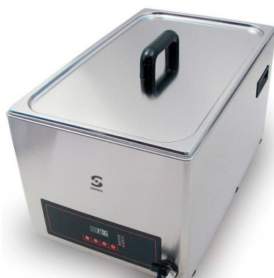
Fig. 1. Digester SVC-14

The study was prepared and a batch of the product was taken by sterile instruments under conditions, excluding contamination of a product by microorganisms from the environment. Samples were selected, according to SS 26669-85. The sample batch of 10 \pm 0.05 was placed in a sterile bottle with 90 \text{ cm}^3 of a sterile physiological solution and mixed by round movements during 10–15 minutes. A supernatant liquid is a washout of microorganisms from the product that is in dilution 1:10.