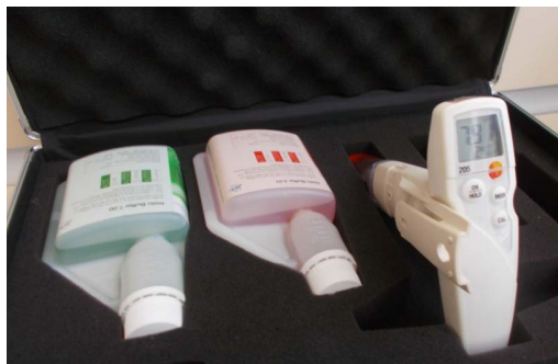
Fig. 2. pH-meter Testo 205

(Ukraine). During the study a concentration of nitrogen ions (pH) was determined. pH index was determined by the potentiometric method, using H-meter Testo 205 (Germany) Fig. 2 . The methodology provides taking of a sample of comminuted meat with mass 10 g and mixing during 25 min in 100 ml of distilled water. After that, the obtained extract was filtered and pH of the filtrate was determined [18].