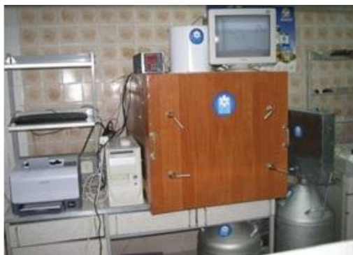
Fig. 1. Cryogenic programmed freezer with software

The rennet cheese was used as the object of research. The nanopowders of the natural spices (fragrant pepper, black pepper-pea, coriander), spicy (ginger, garlic) and carotenoid (carrot, paprika) vegetables were used as enrichment at elaboration of the recipes of fillings for “Pancake” confectionary and snacks on the base of elaborated cheese half-finished product ( Fig. 2 ). At the same time the melt cheese mass after cryo-processing (or cheese half-finished product) and new health-improving melt cheese products such as fillings for the “Pancake” confectionary, received by nanotechnology and cheese snacks – falafels were studied ( Fig. 3 ).