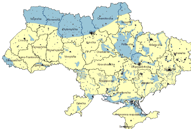
Fig. 1. Distribution of settlements suffered from flood in urban areas of Ukraine

With the use of geoinformation system the most recent data including maps and various layers on urban flooding in Ukraine from State Service for Emergencies and State Geological Service has been integrated into ArcGIS 9. On this basis the map of distribution of urban areas suffered from flooding processed across Ukraine was created (Fig.1).