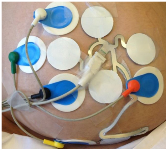
Figure 1. Study patient showing the 5 standard disposable adhesive electrodes (blue) attached along with the condensed electrode patch in which the electrodes are integrated into a flat, flexible cabling assembly (white). Lead wires for each electrode system are attached to an AN24 monitor (not shown).

fixed positions and a fifth that can be moved to ensure its proper placement relative to the maternal symphysis pubis. An effective electrode template would simplify use of an abdominal surface monitoring system, obviate errors in skin preparation and electrode placement, and make the transabdominal approach to FHR and UC monitoring more efficient for staff and more comfortable for patients. To assess the performance of the new condensed electrode array template, or patch, we compared the FHR and UC data generated from it to the data obtained simultaneously from five diffusely arrayed single electrodes.