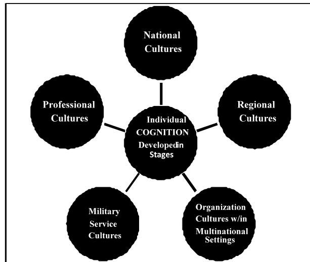
Figure 3 Cognitive Underpinings of Cultural Awareness in the Military Megaorganization

cultural awareness and soft power just described, this article now explores the concept that there is a symbiotic relationship between cultural manifestations and cognitive patterns. The article will then examine the role of culture in shaping attitudes and attributions. Finally, the influence of culture on a leader's thinking is illustrated by its impact on different aspects of communication and decision-making.