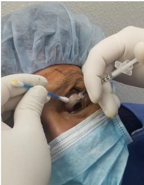
Figure 1. Superotemporal Intravitreal Injection in a Sterile Fashion in the Left Eye.

During a 30-day period (June 2019), 532 patients scheduled for IVI were included for this study at the Asociacion para Evitar la Ceguera en Mexico (APEC) in Mexico City. The study complied with the Declaration of Helsinki. A written informed consent was obtained from all patients. This study received an ethical approval from our academic center. Only one eye of each patient was considered for the study. Patients taking medication for arrhythmia or having a pacemaker were excluded, all other patients were included. All injections were performed in the supero-temporal quadrant location. Injections were done following the 2018 consensus protocol recommendations [43]. The IVI was achieved in a sterile fashion (Figure 1). Heart rate was measured with a pulse oximeter (Zacurate, The USA) before and after placing the eyelid speculum, during the injection and after removing the speculum.