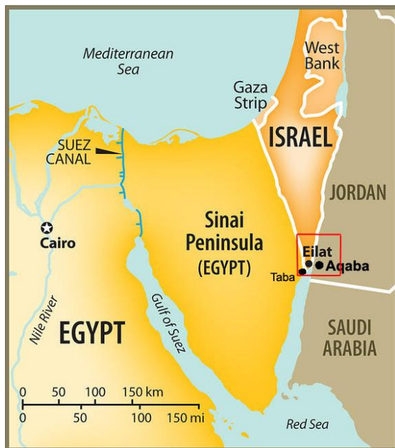
Fig. 1 NEOM Project

This ambitious $ 500 billion project aims to build cities between the borders of Saudi, Egypt and Jordan in the Gulf of Aqaba demanding that the Saudis recognize Israel's existence and integrate Israel into this project due to Israel's geographical position adjacent to Israel (Andrew Korybko, 2017).