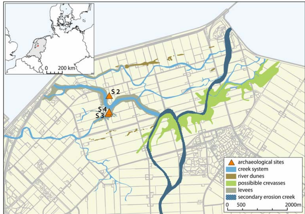
Fig. 1 Map showing the location of the Swifterbant cluster sites along the freshwater creek system (Devriendt 2014, Fig. 2), overlain on a modern map. Insert map showing the location of the Netherlands in relation to Northern Europe and the location of the Swifterbant cluster within the Netherlands

‘extended broad spectrum economy’) (cf. Louwe Kooijmans 1993). As well as investigating the role of pottery in these forager-farmer societies, this study also offers an opportunity to examine inter-site variation in pottery given the different domestic (S3 and S4) and funerary/ritual (S2) functions that have been proposed for these sites (Devriendt 2014: 220). Lipid residue analysis on Swifterbant pottery is also relevant to the broader debate regarding the transition to farming and the role of ceramics therein; a debate that in Northern Europe is dominated by the Ertebølle culture. From its inception in the 1970s, the Swifterbant culture has been considered a western branch of the Northern European Ertebølle culture (De Roever 1979), an interpretation that still finds an audience (cf. De Roever 2004; Rowley-Conwy 2013). A competing interpretation is that its emergence was unrelated to the Ertebølle culture (Raemaekers 1997; Andersen 2010; ten Anscher 2012), whereas this discussion has until now been based primarily on the technology and typology of the ceramics, the functional analysis provided here will add new fuel to this fire.