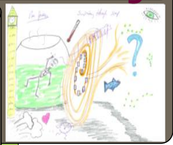
What types of metaphor do you use/work with in practice? (n=21)