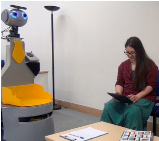
Figure 1: A participant and the robot in the experimental setup.

sented based on how useful and informative people found it and whether it met their expectations for the interaction. People preferred information about the time remaining until a task is complete, which supports our hypothesis that users want information that directly affects them and also does not burden them with the details of how a service is performed. While the participants in this exploratory experiment were not elderly, related literature studying task interruptions found that elderly and non-elderly participants have similar responses. We also intend to validate these results through further experimentation with elderly participants. Evaluating the quality of interaction between elderly people and service robots in realistic scenarios and environments is a key goal of the ROBOT-ERA project, and focussed laboratory experiments such as this one help to inform the design of the system. Finally, we discuss how future work on more sophisticated integration between a dialog system and planner could enable non-expert users to help to modify or repair plans according to their preferences when task execution fails.