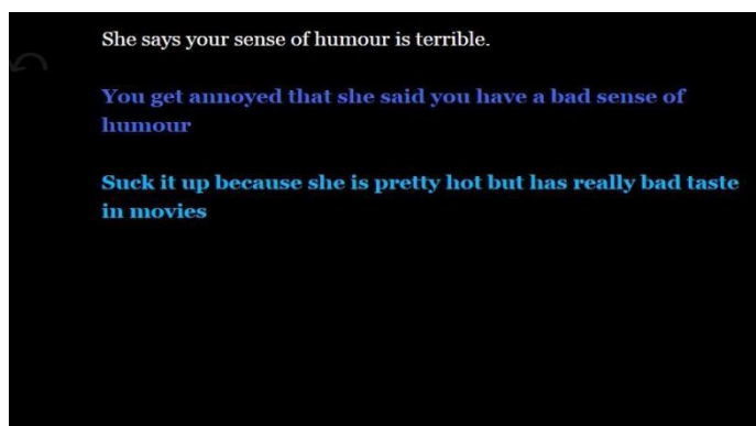
Figure Two: Player Screen of First Date