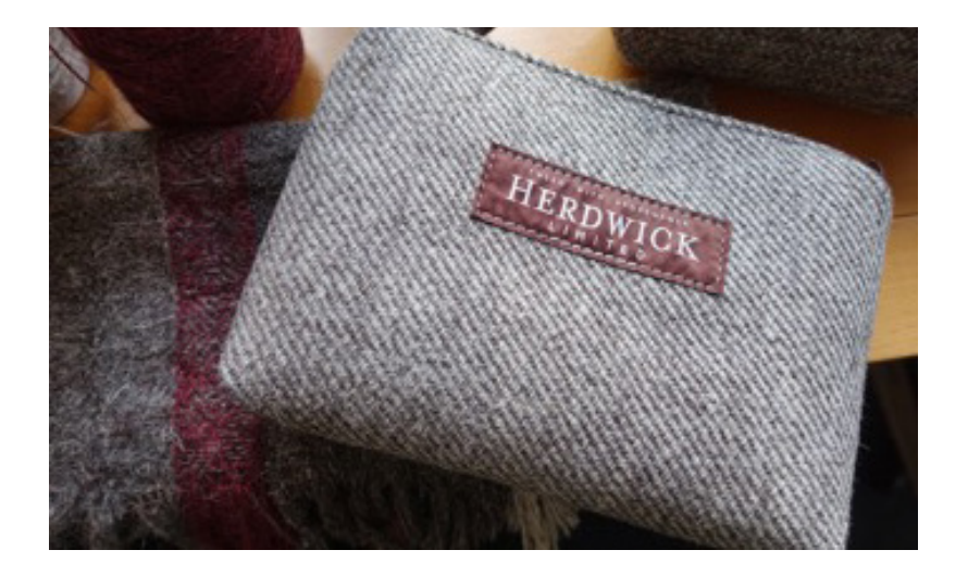
Figure 4. Herdwick Limited bag.