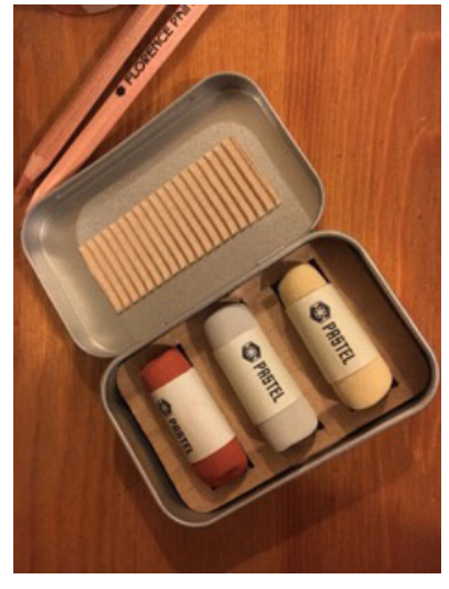
Figure 6. Herdy Shop Interior Figure 7. Florence Paint Maker artist materials.