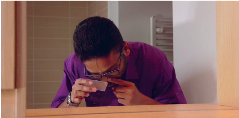
Photo: Nasal irrigation and gargling (from the ELVIS study video, used with permission).

It is unclear if hypertonic saline nasal irrigation and gargling is also effective in COVID-19 caused by SARS-CoV-2; a trial is therefore urgently needed.