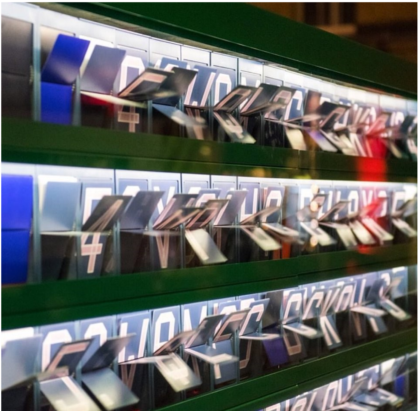
Figure 3. Flip dot display in Every Thing Every Time by Naho Matsuda at South by South West (2019). Produced by FutureEverything.

work, the artists looked at the advances in harvesting and retrieving data on which CityVerve built. The artists sought to identify datasets that would create meaning and relevance for people who may encounter the work. One such dataset was prayer times at the city's mosques, alongside other available open data in Manchester. They also created their own dataset generated not by urban data systems but through observations and desk research.