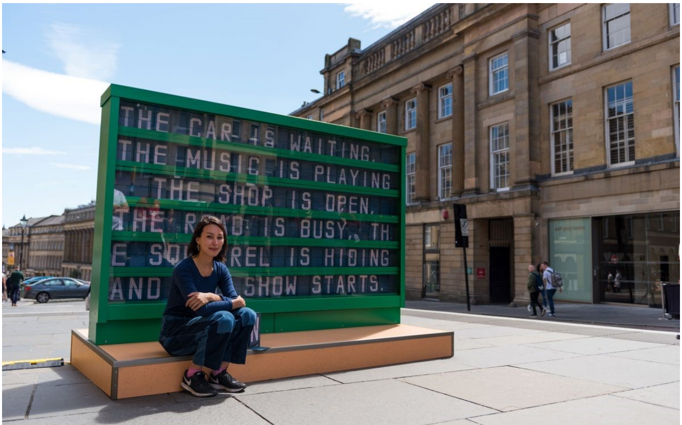
Figure 2. Every Thing Every Time by Naho Matsuda at Great Exhibition of the North (2018). Produced by FutureEverything.

the sun rises the streets are empty today is the last day of the term the car park is almost empty the traffic light turns green the cleaning shift starts the bus is on time and it is colder than yesterday