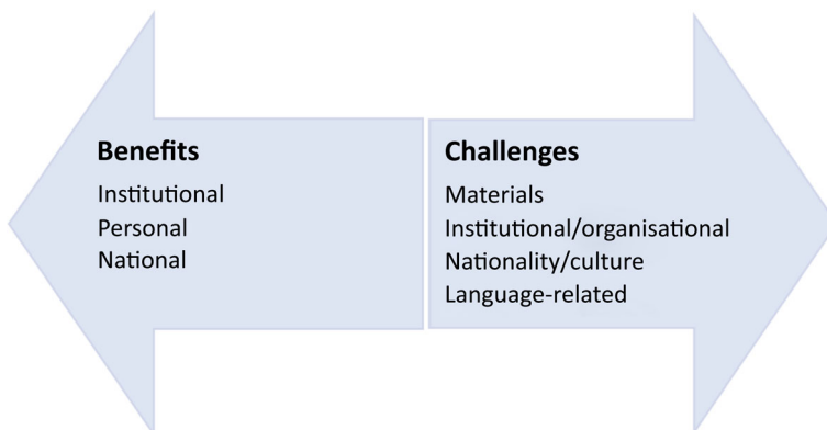
Fig. 2 Perceived benefits and challenges of EMI

English is central to the internationalisation agenda in both countries. In China, EMI provision is part of a Ministry of Education Plan (National Plan for Medium and Long Term Educational Reform and Development), which aims to attract up to 35.5 million international students by 2020 (Perrin 2017). Yet, while internationalisation may be a priority for universities around the globe, we should be wary of promoting both a Westernised and also a monolingual approach to EMI. In addition to further research, clear policies are required at the institutional level to avoid individual instructors having to navigate these ‘dilemmas’, particularly when content instructors are not trained in providing language support or are unfamiliar with teaching an international cohort. This study raises concerns about the need for linguistic support for content teachers as well as the lack of collaboration between EAP and content teachers. Attitudes towards language-related challenges are related to expectations (Galloway et al. 2017), further highlighting the need for institutional-level needs analysis and clear aims, goals learning outcomes, staff training and quality assurance mechanisms.