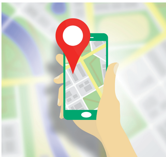
Photo: GPS navigation (from: https://pixabay.com/illustrations/navigation-gps-location-google-2049643/ )

The primary concern in relation to the use of GPS is the amount of information that can be deduced from the person's movements and how that information may be used [16]. In the first place, continuous monitoring of one's activity by a researcher, even where consent is initially given, poses the threat of invasion of privacy and may lead to psychological implications from the feeling of being "watched" [17]. Bearing in mind the privacy implications, only movement data for visiting health facilities from the care-seeking study were archived, avoiding archival of other movement data as agreed during the consent. The location data available to researchers were de-identified and included geo-coordinates of households and health facilities only. Any data that included personal identifiers were first transferred to electronic database stored under high security. The data were then de-identified before analysis. The phone data were identified by numeric ID assigned to each phone and the participant was identified by study ID; identi-