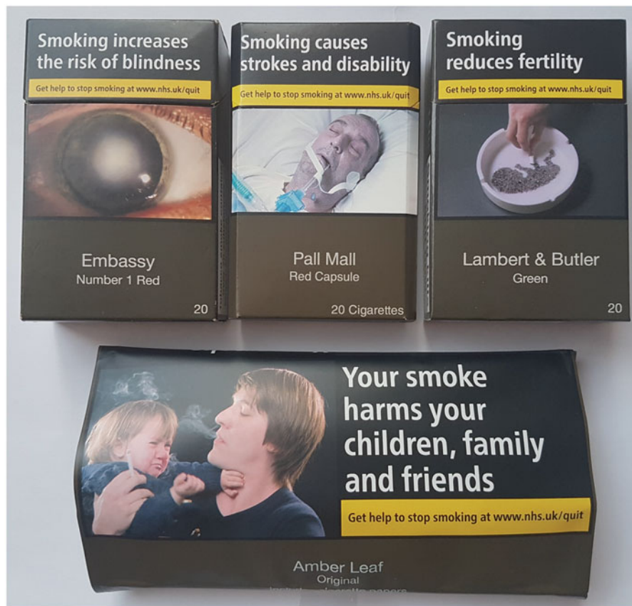
Figure 1. Standardised packs used in the survey.

Regulations (TRPR) requires pictorial warnings covering at least 65% of the principal display areas and text warnings on at least 50% of the secondary display areas. Prior to the legislation, in the UK a text warning covered 43% of the front, and a pictorial warning 53% of the back, of packs. The TRPR also requires the inclusion of cessation resource information (e.g. a stop-smoking helpline and/or web address) on each warning, with the UK Government opting to include a stop-smoking web address (Figure 1 shows standardised packaging in the UK).