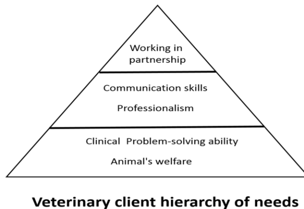
Figure 2. A proposed model for a veterinary client hierarchy of needs

The capabilities presented here show one view of what veterinary clients may want from their vets and it should not be assumed that this is an exhaustive list that if followed will guarantee a quality positive client experience for every client. Ultimately a veterinarian who meets client A's needs and expectations could fail to meet client B's needs and expectations even while demonstrating the same capabilities. This is important for educators to bear in mind when preparing students to deal with what may, at least initially, be an uncomfortable level of inconsistency. An additional area of challenge relates to another key theme from the interviews around the importance of vets not being seen to be motivated by money. Yet clearly from a business perspective, realistic charging is essential for sustainability and ongoing quality patient and client support. Both highlight the importance of gaining the relevant client's perspective both on their expectations and the financial implications from the earliest possible stage of the relationship, as discussed earlier.