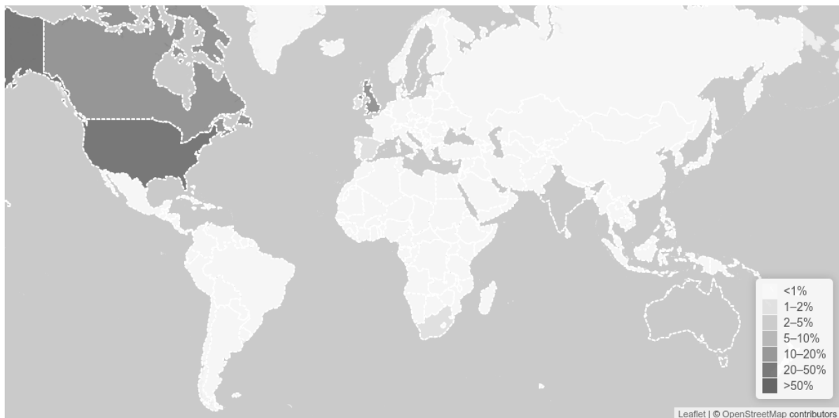
Figure 1: World map of proportion of tweets by country of origin.

Secondly, it was clear that there were spikes in the amount of tweeting about feminism over our selected period, as shown in Figure 2. These tallied with what was happening in the social and political world beyond Twitter – specific campaigns, media projects, news-stories that flared up for a time and then settled back down again. So the spike in mid-2013 can be explained by the launch on 27 th April of a petition by Caroline Criado-Perez to demand that the Bank of England reconsider its decision to remove the only woman (Elizabeth Fry) from the £5 note; the filibuster on 25 th June by Texas senator Wendy Davis to stop a law to close down abortion clinics; the speech on 12 th July by Malala Yousafzai at the United Nations in New York, where she argued for young women’s right to education; and a blog by Feministing on 22 nd July, which railed against sexual assault and rape culture. Feministing filed a complaint against Yale University in connection with a specific incidence of rape, and US President Barack Obama subsequently formed a taskforce to tackle what was presented as an epidemic of sexual violence on college campuses.