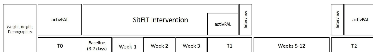
Figure 1 Intervention and data collection timeline.

Separate semistructured interview guides were developed for each follow-up time point. The interview topics at T1 were: how the participants used the SitFIT and which aspects they found more and less useful (in particular, the feedback on sedentary or upright time). At T2, the interview focused on the maintenance of behaviour change. The first interview lasted 20–30 min, and the second interview lasted around 5 min.