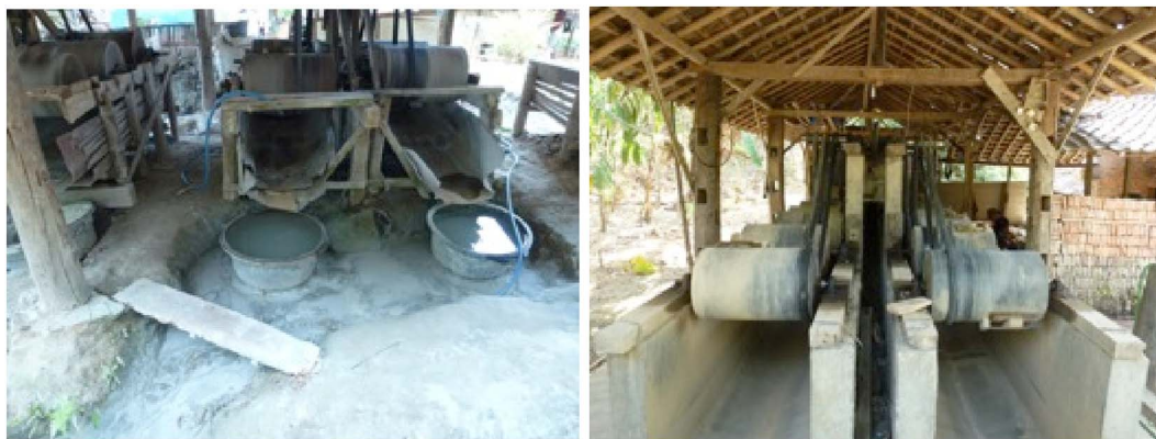
Fig. 2. Tromols for mercury amalgamation at homes in Jendi.

economic relationships between the miners and processors, YTS staff realized that establishing a centre at the Karang Jawa site could be highly problematic; the main reason for this being that all of the processing sheds at this location operate on a for-hire (rental) system whereby the miners bring their own ore to the shed for processing by the shed workers at no cost. In Karang Jawa, like in many other sites across Indonesia in which YTS had conducted intervention projects, owners of gold processing centres were providing mercury for free to small-scale gold miners who processed their ore there – on condition that miners leave their tailing waste behind. The tailing waste then becomes the property of the processor, who uses a cyanidation process to extract the residual gold that small-scale gold miners cannot obtain by amalgamation at the first stage of gold recovery.