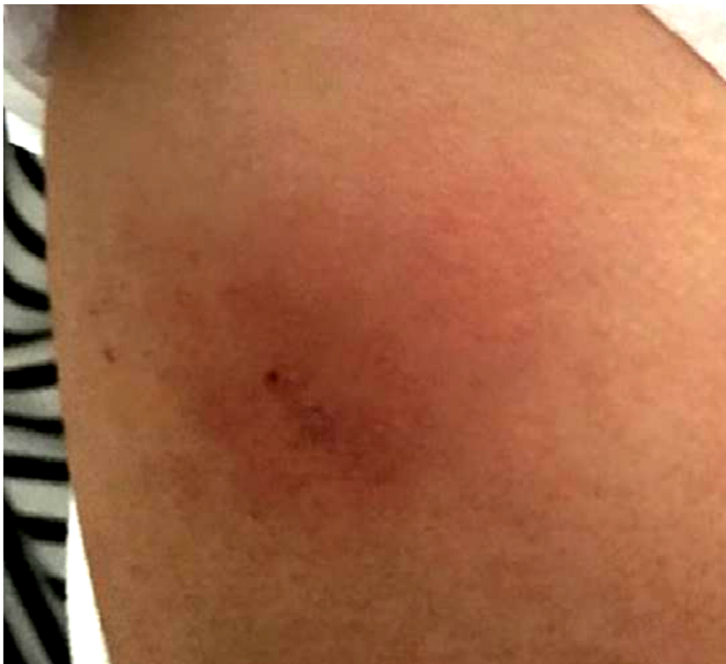
Figure 4: Local reaction after vaccination at 3, 5 and 12 months of age with DTaP-Hib-polio