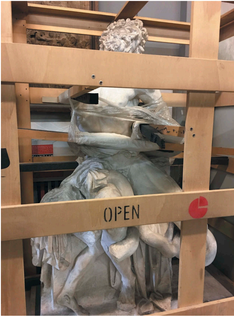
Figure 10. Laocöon plaster cast, n.d., Accademia di Brera, Milan.

arts' he titled it 'The New Laokoön' to turn again to the problem of disentangling text/image relations. 34 In this regard it is surely salient that, since the time of its Napoleonic presence in Paris, Laocöon became an emblem of political satire across Europe and America, text and image interwoven as bande dessinée to parody injustice, from ministerial wrangling to the strangling bureaucracy of the state (Figure 11). 35 When the leading art critic of the mid-twentieth century, Clement Greenberg, put the case for abstract expressionist painting in 1940, he wrote under the title of 'Towards a Newer Laocöon'. His text dismantled the word-image translation nexus in which the Plinian-Renaissance Laocöon was so fully wrapped, taking up again Lessing's call of medial 'purity' to end the 'confusion' of literature and art. Indeed, his call for painting was to abandon completely its claim to narrative illusion in the name of abstraction. 36 If the sculpture itself is nowhere to be found in Greenberg's text, yet the Laocöon title's lexical reference endured. Stripped of its