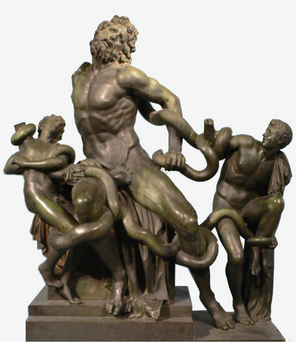
Figure 5. Francesco Primaticcio, Laocöon , 1543, Fontainebleau, Musée National du Château.

prize rested on the resolution of Laocöon's missing arms which the students were invited to complete. Thereafter, artistic copies of Laocöon increasingly translated its damaged form into sculptural completion, producing artistic dialogue between its many versions and a lexicon of variations to compare with the canon of antiquity in a further paragone of ancients and moderns. Thus, the missing right arms became the 'puzzle' of the Laocöon , and the loci of its inventive translation in all media of art. 15