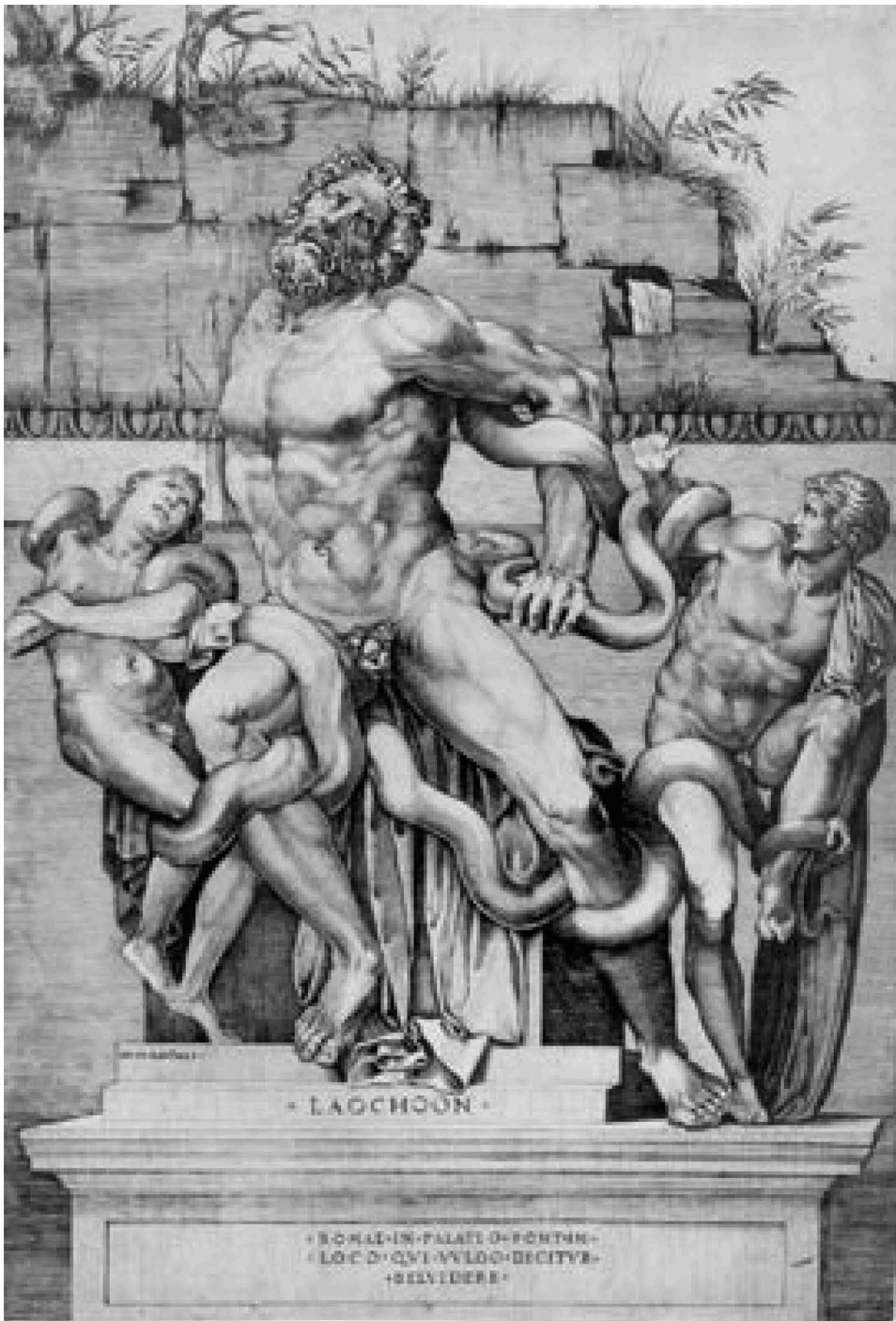
Figure 1. Marco Dente da Ravenna, Laocöon at the Servian Wall , c. 1520–23.