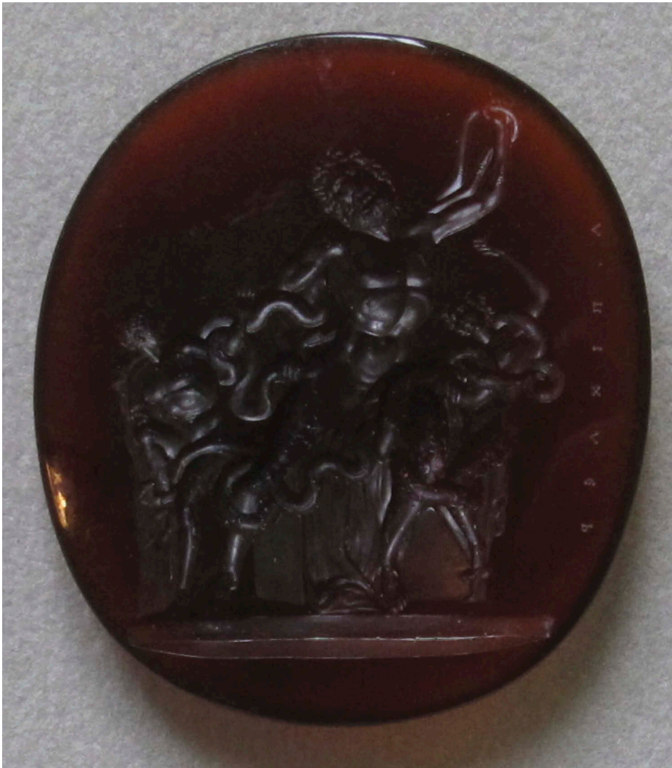
Figure 4. Luigi Pichler, Cornelian Laocöon , c. 1790, Rome, Cabinet des Médailles, Paris.

Key to the competition was the reconstruction of Laocöon's missing limbs, for the sculpture had been found with incomplete arms and hands. Some of the earliest reproductions of Laocöon represented the sculpture as it was extracted from the ground, missing the right arm of the main figure and that of his younger son, the right hand of his older son, and possible further serpent coils around them (Figure 5). As with the Renaissance retrieval of other antiquities, however, and of which Laocöon would be a leading example, the process of translating the piece from excavation to display prompted completion of missing parts in the interests of the narrative of the work, as understood through the prism of art's paragone with poetry. Bramante's competition launched the long history of Laocöon imitation as a field of invention, for the art of the