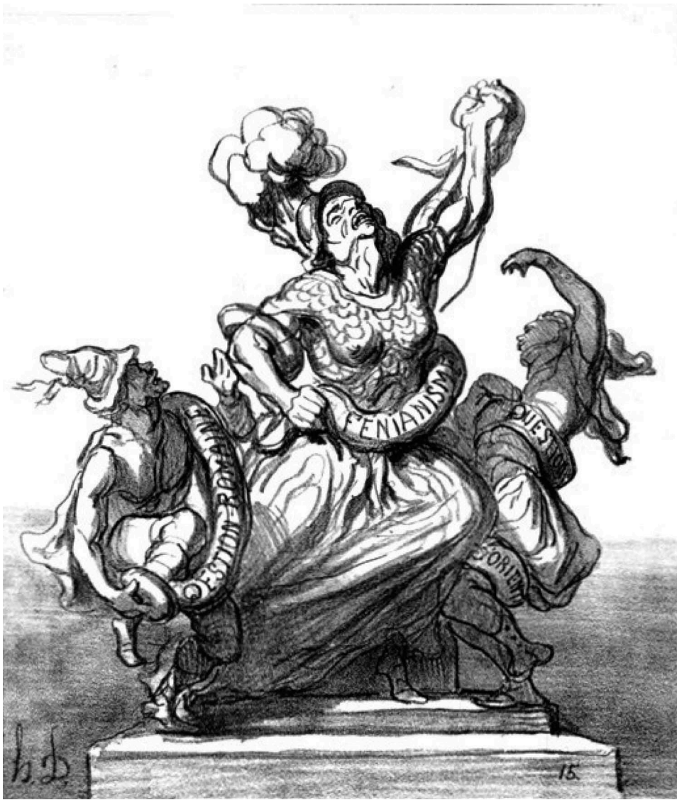
Figure 11. Honoré Daumier, Le Charivari, Paris, 6 April 1868.