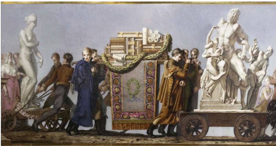
Figure 8. Antoine Béranger, Sèvres vase, detail, 1813, Musée National de la Céramique, Paris.

decline. 24 It is true that prints and plaster casts of Laocöon would continue to be made in ever-growing numbers, by print publishers and casting workshops in both Paris and Rome. With a wide diaspora across Europe and beyond, it served the needs of greatly expanding numbers of museums and art academies across the nineteenth century as the