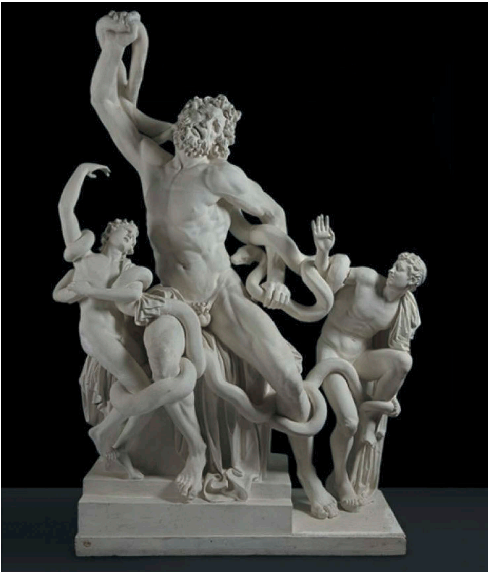
Figure 6. Laocöon plaster cast with raised arm, prior to the 1959 restoration, Ashmolean Museum, Oxford.

three weeks after the coup d'état that brought Napoleon to power at the end of 1799, the new 'emperor' visited the Louvre to oversee himself the installation of his artistic booty, assigning Laocöon a room of its own and in its name as a sign of its artistic apotheosis. 22