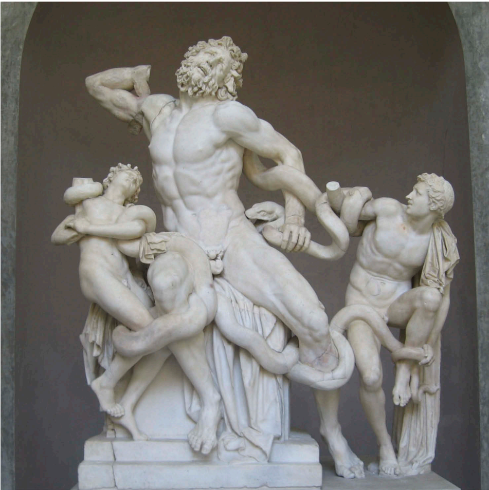
Figure 2. Hagesandrus, Polidorus, Athenodorus of Rhodes, Laocöon , 40–30 B.C., Vatican Museums, Vatican City.

composition. The traces of graphic media on paper, as the record of this memorative process of drawing, produced a wealth of transcriptions in imitation of the Laocöon in all media, materials and sizes. Thus, Laocöon would become the key exemplum of all the Renaissance arts of visual translation.