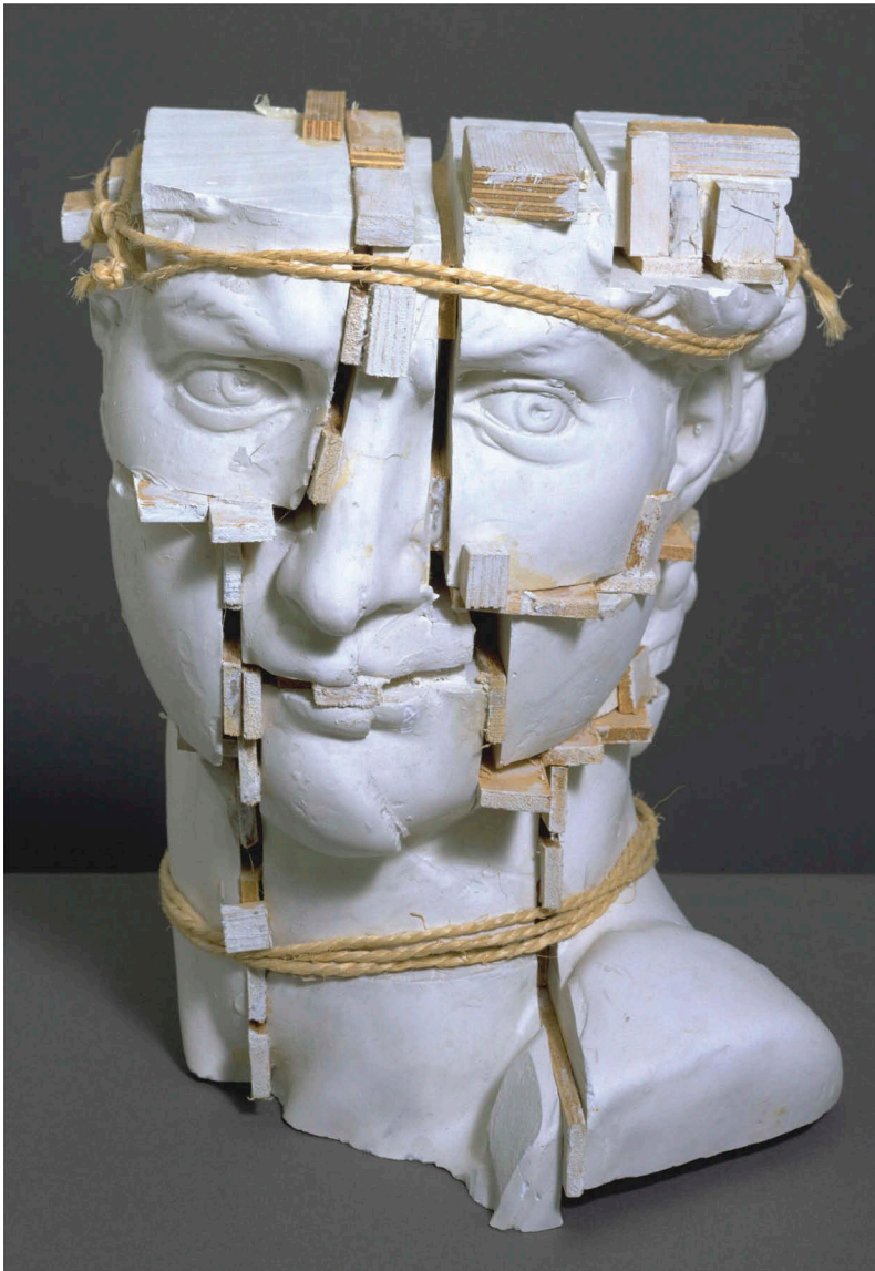
Figure 9. Eduardo Paolozzi, Michelangelo's David , c. 1987, Tate Galleries, London. Photo: © Trustees of the Eduardo Paolozzi Foundation, licenced by DACS 2018, Tate Images..

their destruction is just as forcibly a recollection of their enduring presence within his oeuvre, and to their long pedagogical history as the source of art's authority. Laocoon too endured in his work, though translated and reframed: in his 1963 collage, The Metallization of a Dream ; in the title of an aluminium sculpture of that same year; and radically transposed in the coiling metal tubes of his Poem for the Trio MRT (1964) as an homage to sculpture's history. Howsoever displaced as a material or mimetic source, Laocoon's name remained as the sign for critical debate on the condition of art. When literary critic and scholar Irving Babbitt wrote his 1910 polemic on the 'confusion of the