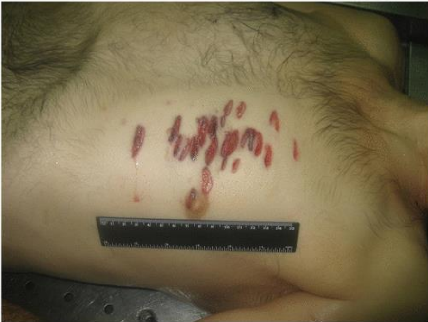
Figure 3. Multiple parallel stab wounds to the chest (case 6).