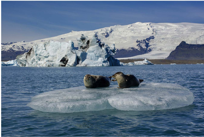
Fig. 3. The practice and history of seal hunting in Iceland has been documented in great detail by Luðvík Kristjánsson (1980) and is clearly as old as the first settlement. Seals appear to have been an important addition to the daily diet, especially at times when other traditional food sources failed. Several proverbs testify to this fact, including Selurinn er sæla í bú : (“A seal means contentment in the home”). In Norse Greenland this pattern of small scale hunting changed dramatically with seals becoming increasingly important for subsistence. The photograph shows common seals ( Phoca vitulina ) on a calving iceberg in the glacial lagoon Jökulsarlón in southeast Iceland. Öræfajökull can be seen in the background.