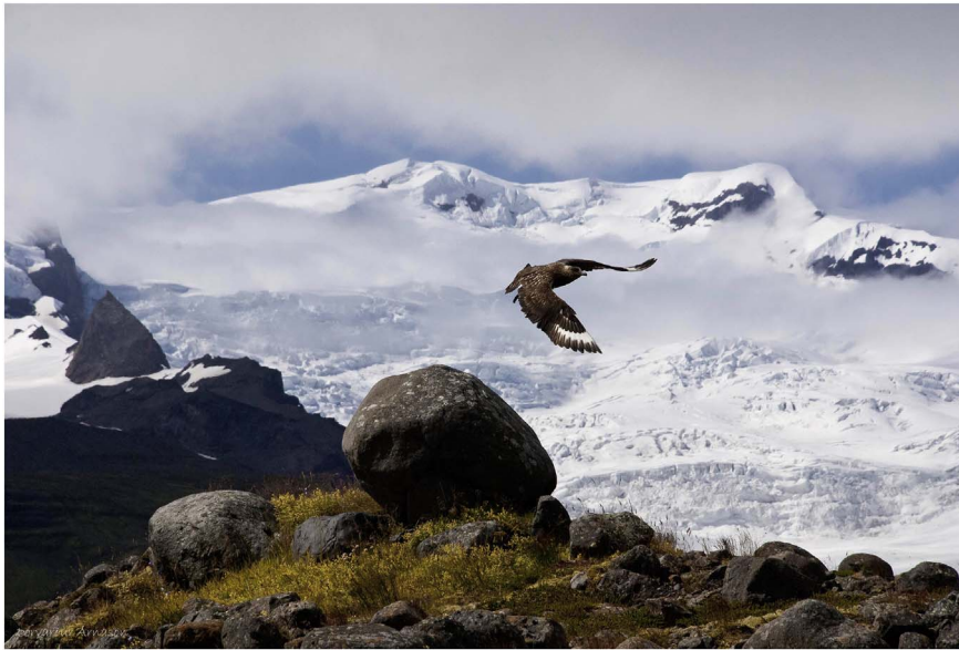
Fig. 1. The photograph shows a Great Skua ( Stercorarius skua ) flying over Hornafjörður in southeast Iceland. The area is one of the main breeding grounds for these birds. In the background is Öraefajökull, an outlet glacier of Vatnajökull. Considerable melting has taken place in recent decades and the nearby glacial lagoon Jökulsárlón featuring calving icebergs has become a major tourist attraction (see Fig. 3). The area features in Njál's Saga as the character Flosi Þórðarson, one of the leaders of the group who burn the eponymous character and his family alive in their home, lived there at a farm called Svínafell. The region was devastated in 1362 after a volcanic eruption in Öraefajökull.

farming community and the name was subsequently changed from Litla Hérad (the “Little District”) to Öræfi , the “Desert” (Thórarinnsson, 1958).