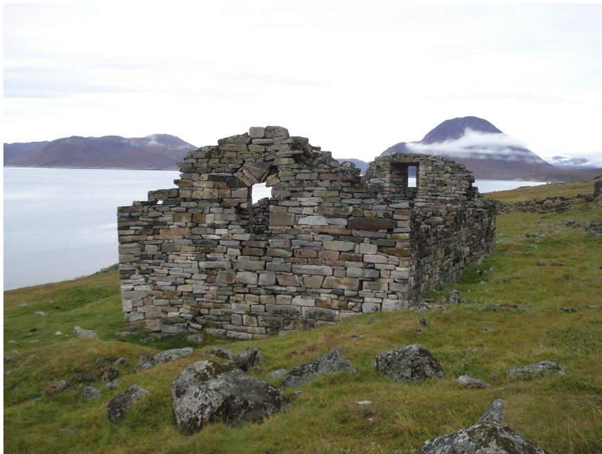
Fig. 4. One of the very last written records giving information concerning the Greenland Norse is to be found in an entry in the Icelandic Annals for 1408. This entry documents the wedding of Sigríður Björnsdóttir and Þorsteinn Ólafsson, both from Iceland. The photograph shows the ruin of Hvalsey church, originally built ca. 1250, where the marriage was solemnized on 16 September 1408. The church is adjacent to the Hvalsey fjord near modern-day Qaqortoq in the Norse “Eastern Settlement” area. Hvalsey means “Whale Island”.

2013). Paralleling this development, woolen cloth fragments show standardization into a legally defined commodity (Hayeur-Smith, 2013).