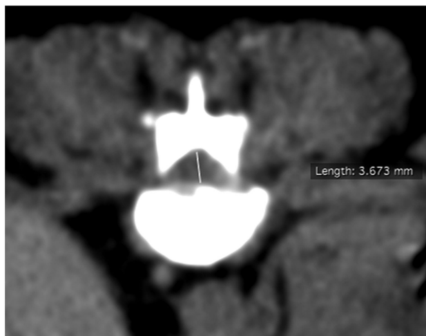
FIGURE 1 | Preoperative transverse computed tomography image at site of maximal compression with measurement of minimal cross-sectional dimension.